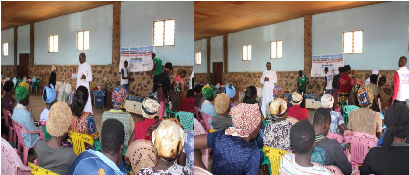
Caritas Kumbo coordinator gives word of hope, encouragement and consolation to the internally displaced and their hosts (Meluf)