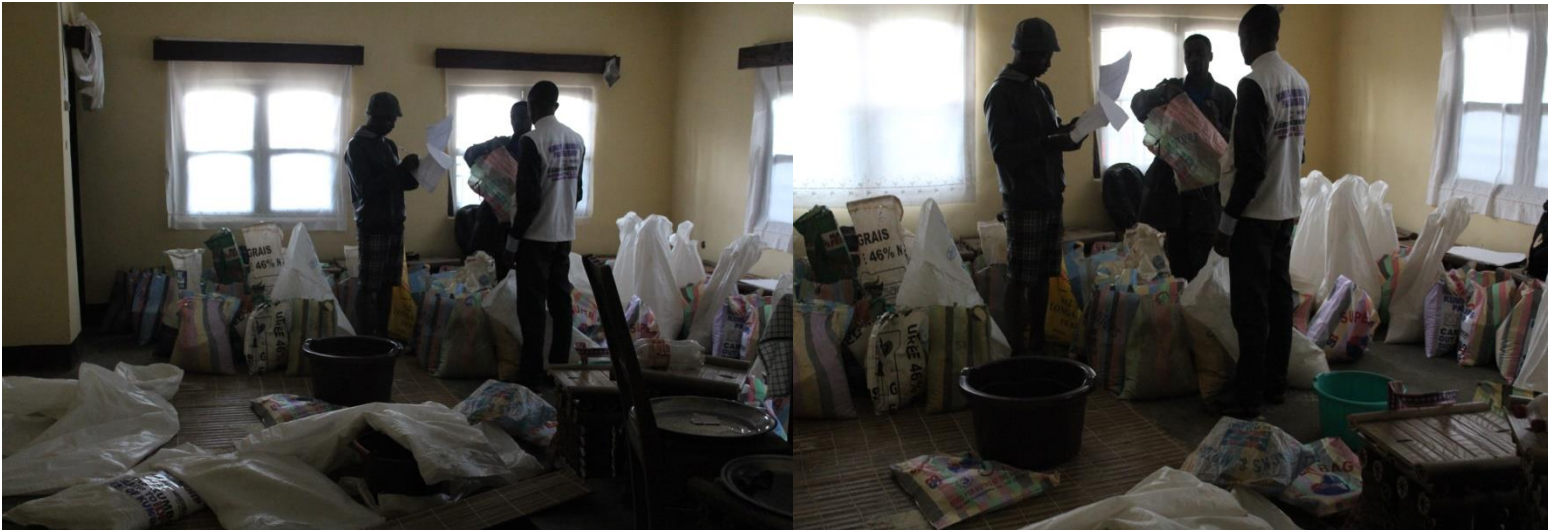
Picture 37: Social Welfare commission members assisting in rationing, Buh