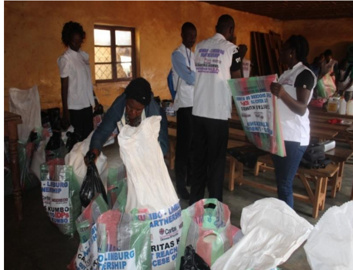
Picture 14: Outreach team cross checking food rations for IDPs in Mbveh Parish