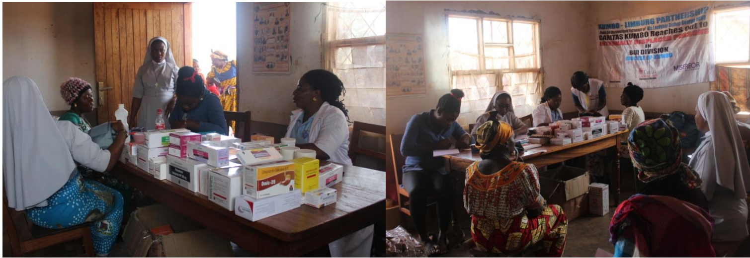
Picture 16: Attending to the Health needs of the Internally Displaced Persons in Sop Parish