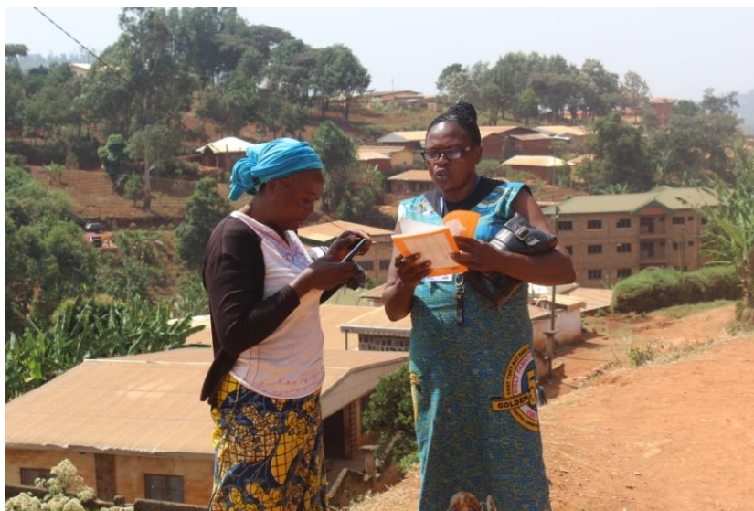
Picture 12: One on One encounter with a traumatized lady in Mbveh who does not know the whereabouts of the husband who escaped for safety