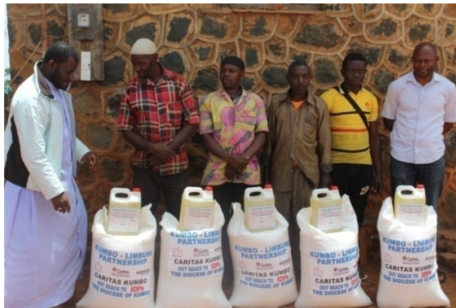
Picture 2: Parish Priest (extreme left) and seminarian (extreme right) join the victims to receive their food assistance