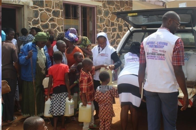
Picture 19: IDPs in Nkar chant songs of joy to welcome the outreach team Picture 20: IDPs in Nkar assist the outreach team in offloading food stuff from the pickup van