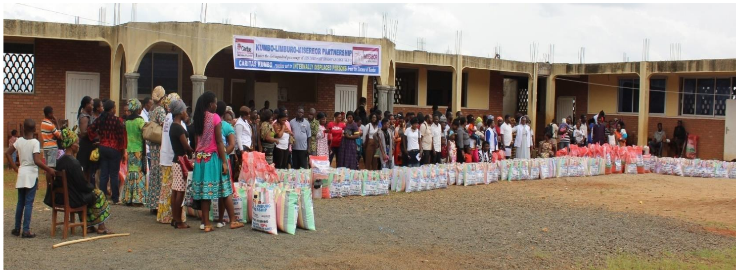
Picture 25: Cross section of Internally Displaced Persons in Bamenda, in groups according to lists on which they were identified