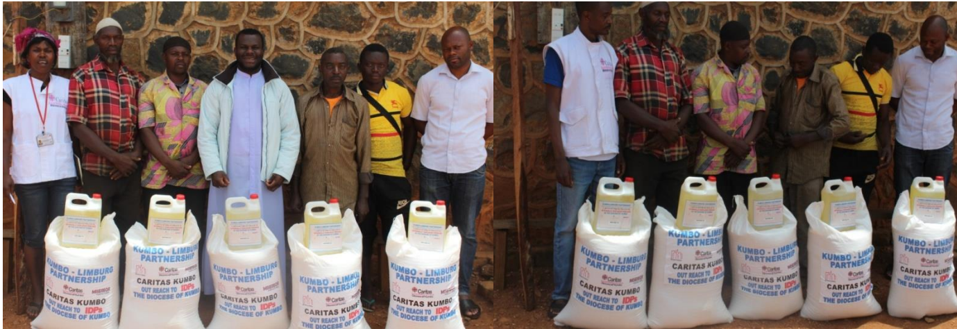
Picture 1: Victims Of burnt homes in Wainamah receive food assistance from the Diocese of Kumbo