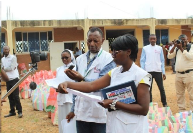
Picture 26: A word of Hope and encouragement from the Coordinator Picture 27: reading of the Bishop's address to the IDPs in Bamenda