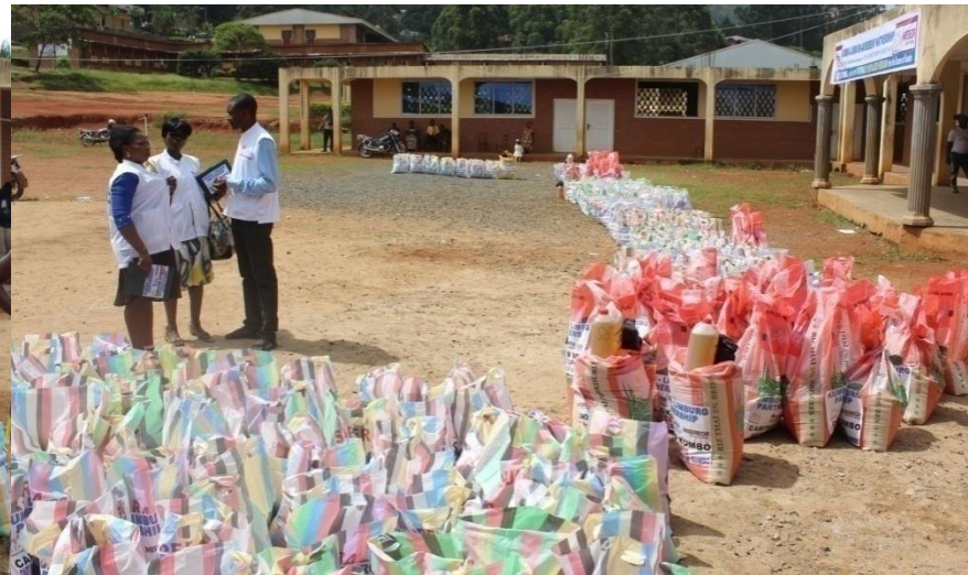
Picture 28: Coaching on the importance of good health, hygiene and sanitation practices Picture 29: Hundreds of food packages rationed and ready to be served IDPs in Bamenda