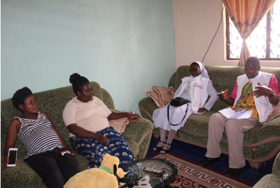
Picture 37: Mrs Wirba and the pregnant girl receive psychosocial support and health education

They were educated on some health and family life tips.