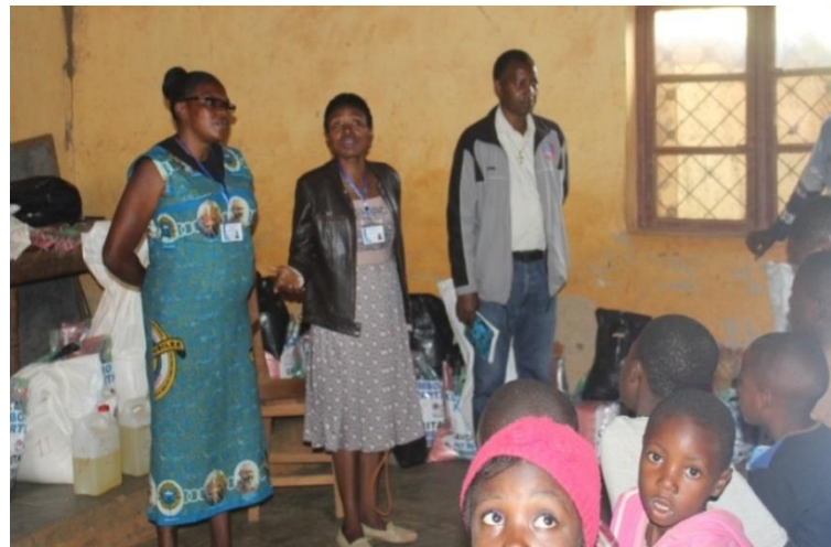
Picture 11: Diocesan Family Life Counselling Team giving psychosocial support to the Internally Displaced Persons in Mbveh