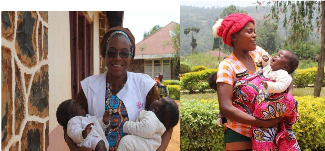
Picture 24: Presence of the twin boys and their young mother who is a mother of two sets of twin boys made our day even better in NKar