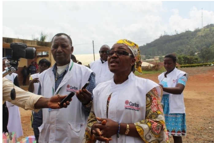
Picture 31: Home and family management in the face of crisis as a means of keeping families intact (Diocesan Family Life Office)