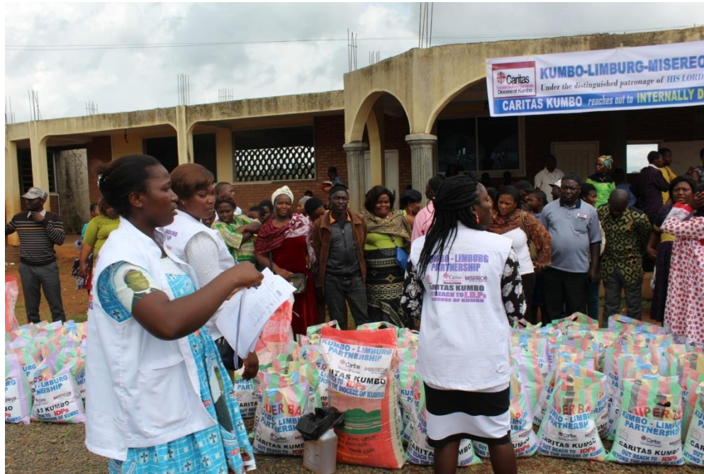
Picture30: Coaching IDPs against human rights abuse and human trafficking which could arise as a result of vulnerability of victims