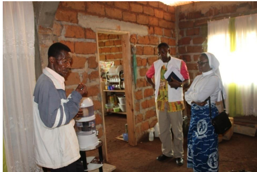
Picture 30: A host and family head displaced from Djottin talking with the outreach team about family situation