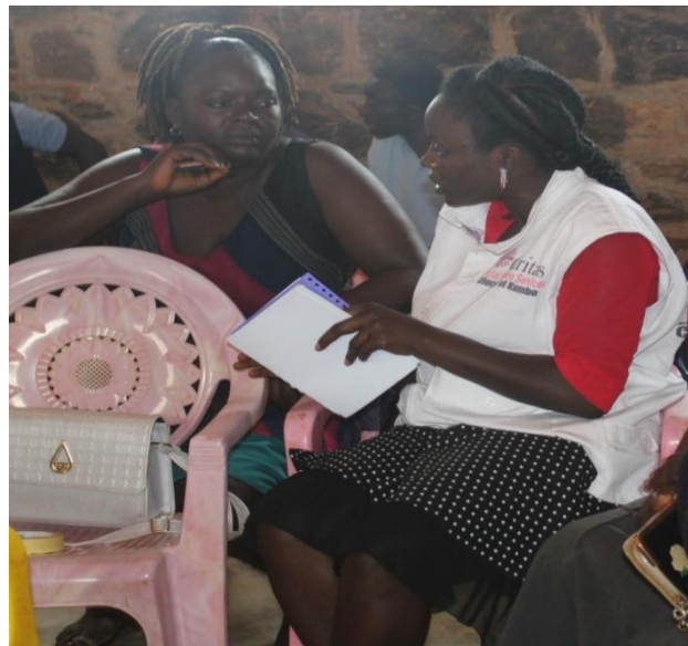
Picture 9: Offering psychological support/trauma care to emotionally traumatized victim