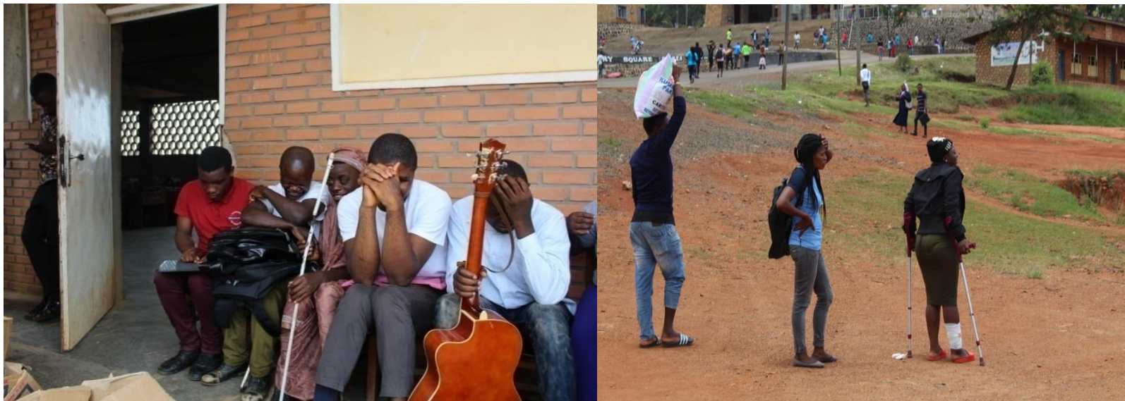
Picture 32: People enabled differently (the displaced visually impaired) were part and parcel of the outreach in Bamenda