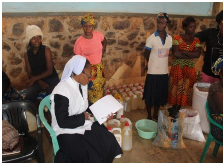
Picture 6: Cross checking names on register to ensure everyone is served